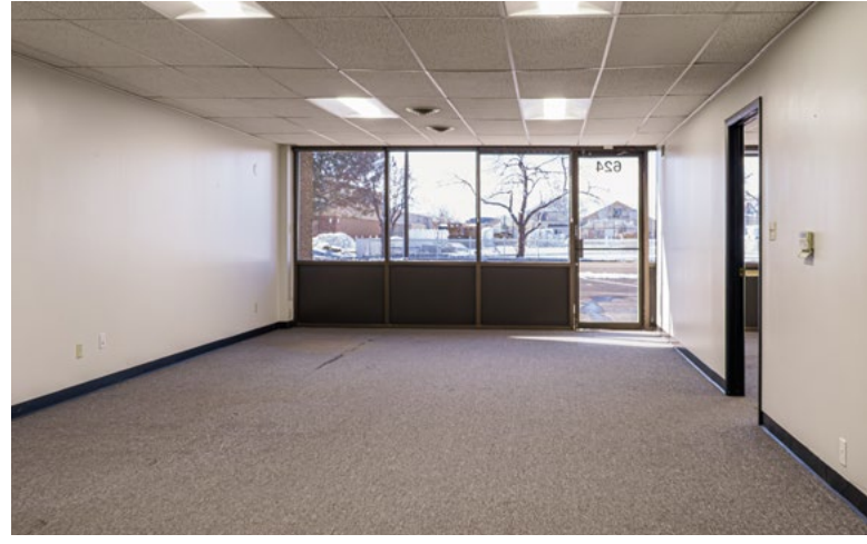
All information furnished regarding this property is obtained from sources deemed reliable. Dean Callan & Company, Inc. makes no representation, guarantee or warranty, expressed or implied, as to the accuracy thereof.